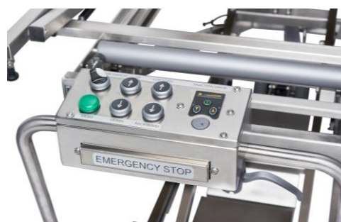
Control unit with forwards/backwards buttons

An additional electrical drive roller can be installed at the roller track of any lift and transport truck from our HTW 50/xxx and HTW 51/xxx range to automatically put a body tray off the truck onto the shelf. The drive roller is operated through forwards/backwards buttons at the control unit. The power supply is provided by means of the built-in battery.