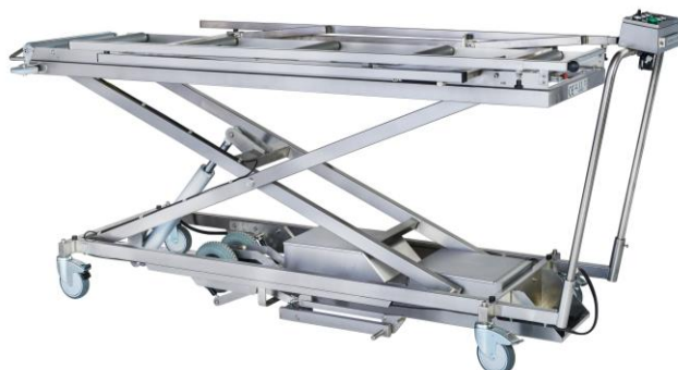
Lift and transport truck with drive roller MTR-RB 24V and traction drive FAT-HTW-24