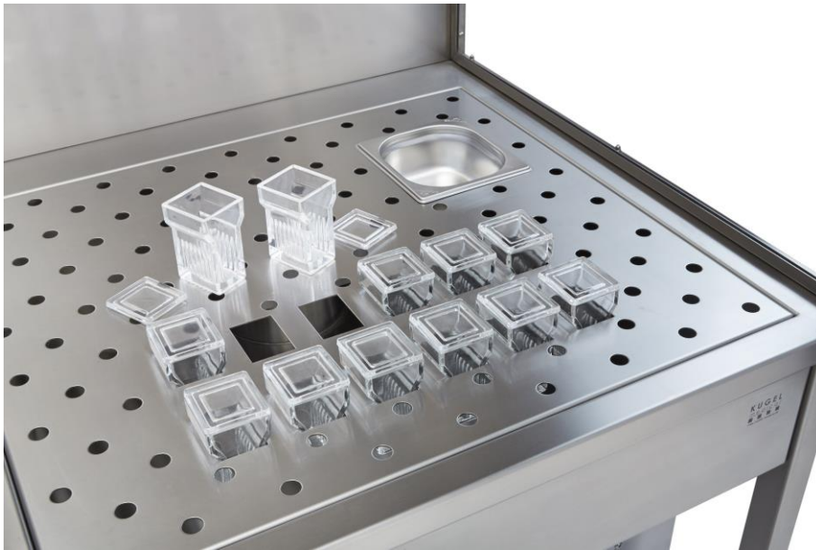
Perforated working area with openings for glass cuvettes (customized solution)